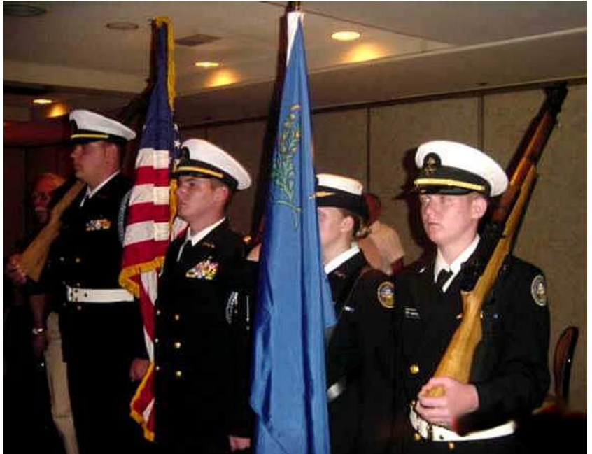
NJROTC, Centennial High School, Las Vegas