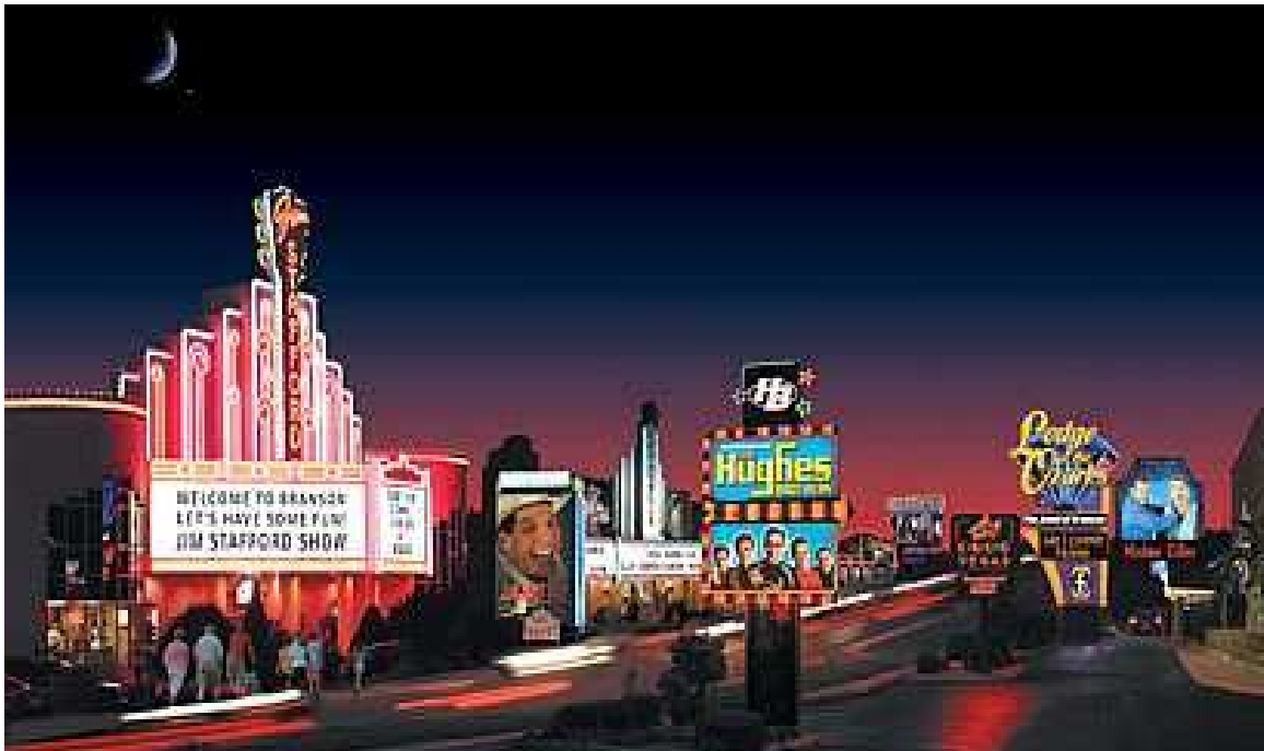
The Branson "Strip" at night